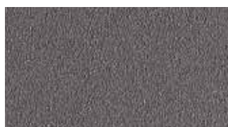
Graphite grey NCS S 7500-N RAL 7024