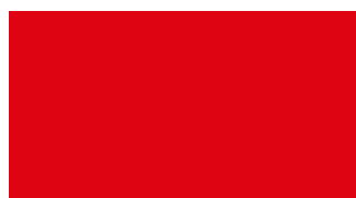
Neon red NCS S 1085-Y90R RAL 3020