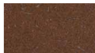
Cloudy brown NCS S 7020-Y60R + 8010-Y50R RAL 060 30 20