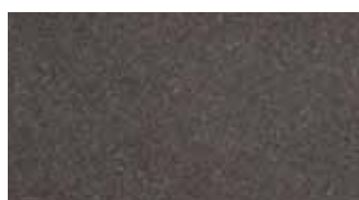
Cloudy anthracite NCS S 7502-Y + 8000-N RAL 7024